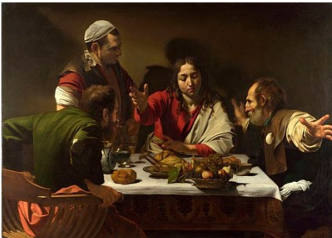
Supper at Emmaus (1602/3) by Michaelangelo da Caravaggio, National Gallery, London

Nottingham Presbyterian Church—Bringing the love of Jesus to our community with an accepting, nurturing and compassionate environment.